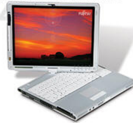
LifeBook® T4215 Notebook PC